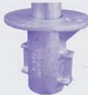
134 ② ③ ④