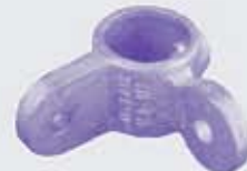
168m ① ② ③ ④ ⑤