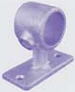
143 ① ② ③ ④