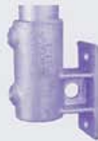
144 ② ③ ④