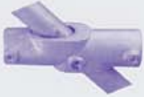
126 ② ③ ④