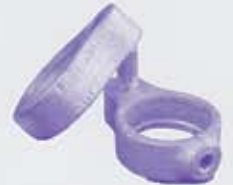
138 and 140-4 ① ② ③ ④