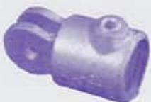
173 ① ② ③ ④ ⑤