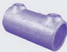
149 ① ② ③ ④ ⑤