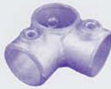
116 ① ② ③ ④ ⑤