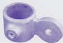
173 ① ② ③ ④ ⑤