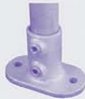
132 ① ② ③ ④ ⑤