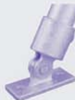
169 ① ② ③ ④ ⑤