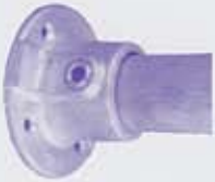
131 ① ② ③ ④ ⑤