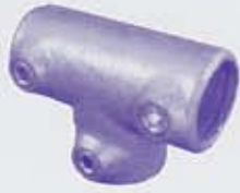
104 ① ② ③ ④ ⑤