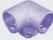
128 ① ② ③ ④ ⑤