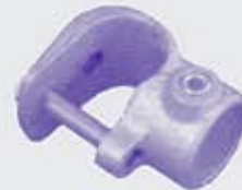
135 ① ② ④ ⑤