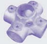
158 ① ② ③ ④ ⑤