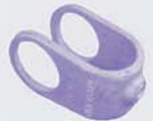
160 ① ② ③ ④ ⑤