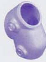
129 ② ③ ④