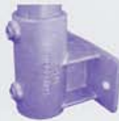
145 ② ③ ④