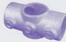
119 ① ② ③ ④ ⑤