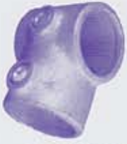
101 ① ② ③ ④ ⑤