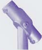
127 ② ③ ④