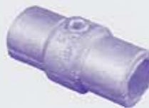
150 ② ③ ④