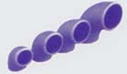
weldable elbows 1/2" NB to 4" NB