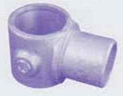
147 ② ③ ④