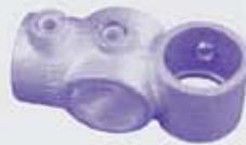
165 ② ③ ④ ⑤