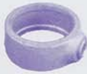
179 ① ② ③ ④