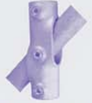
130 ② ③ ④