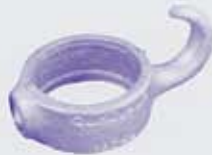
182 ② ③ ④