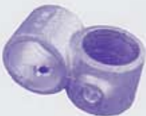
161 ① ② ③ ④ ⑤