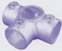
176 ① ② ③ ④ ⑤