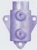
146 ② ③ ④