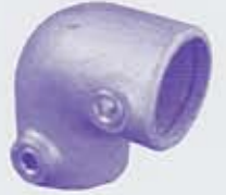
125 ① ② ③ ④ ⑤