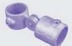
173 ① ② ③ ④ ⑤